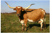
MY MY MY