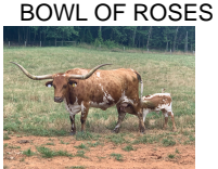
BOWL OF ROSES