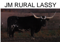
JM RURAL LASSY