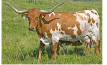
FIELD OF ROSES